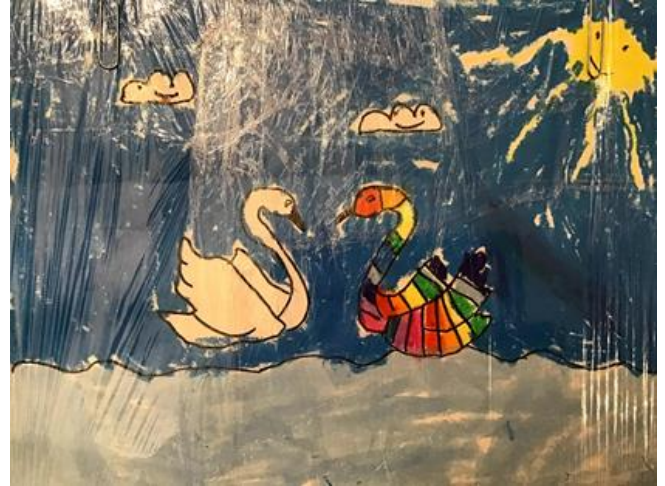
3rd Place - "Love Birds" - Demetra Xifaras - age 6 - Farmington - Home Studio