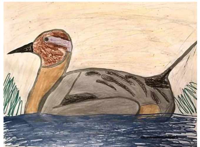
3rd Place - Pintail - Domenic Macini - West Haven