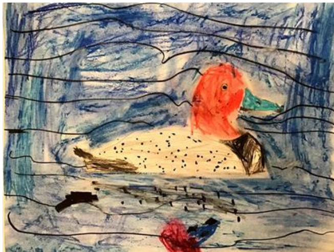
2nd Place - Redhead - Bryn Samor - age 8 - Oxford - Quaker Farms School