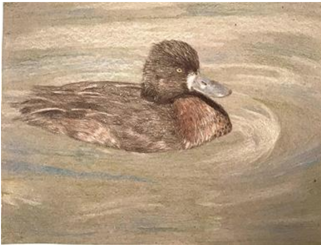
1st Place - Bluebill - Meredith Berkin - age 10 - Wallingford - Home Studio