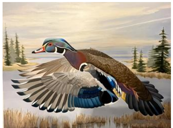
1st Place - Wood Duck - Sophia Archer - age 17 - Old Lyme - Home Studio