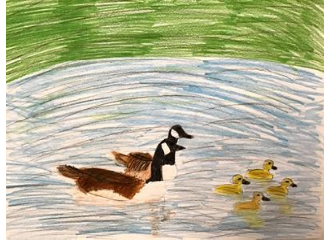
2nd Place - Canada Geese - Macayla Samor - age 10 - Oxford - Oxford Center School