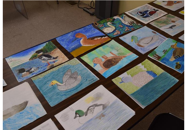
An example of some student submissions