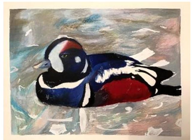
2nd Place - Harlequin - Melanie Verbridge - age 13 - Pawcatuck - Home Studio