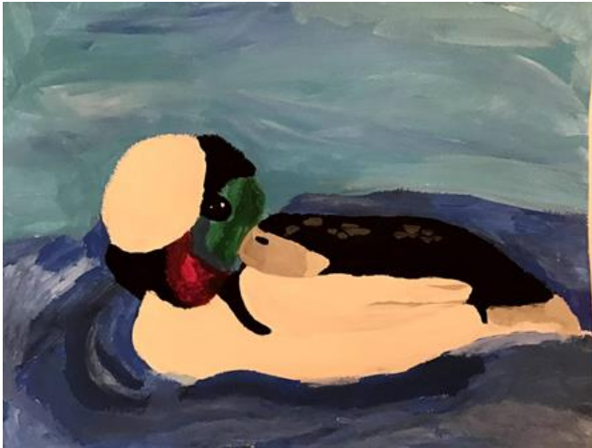
1st Place - Bufflehead - Adele Morgan - age 9 - Simsbury - Tootin' Hills Elementary