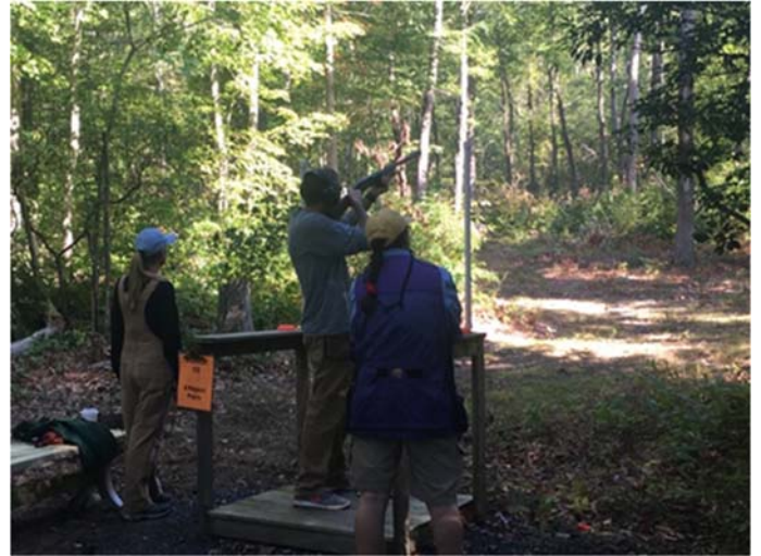
September 19 th , 2021 Guilford Sportsman's Association