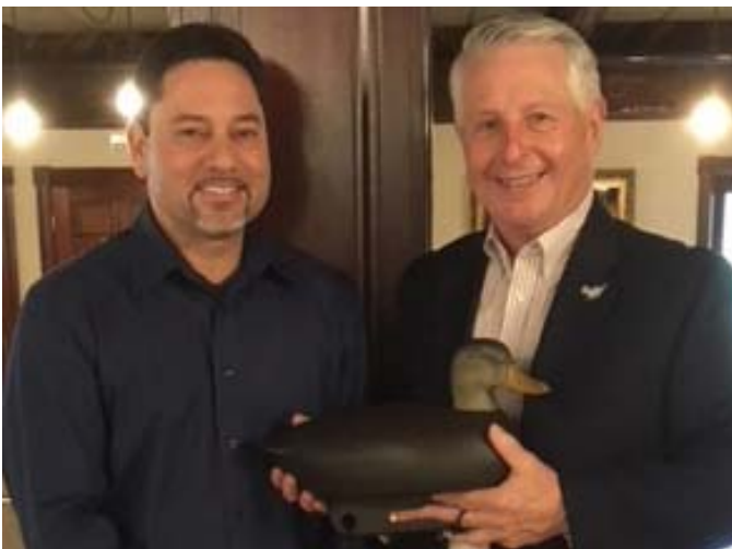
Folks enjoying the banquet.